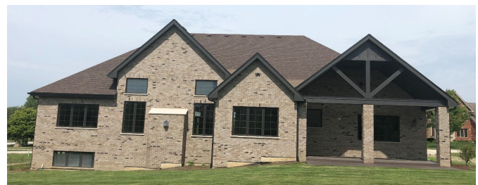
Partial Look-Out Basement and Covered Porch

Other Layouts Available - We customize to your needs.