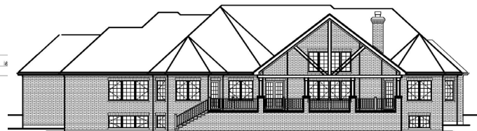
Rear Elevation: Raised Covered Concrete Patio

Other Layouts Available - We customize to your needs.