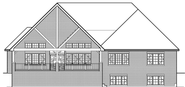
Rear Elevation: Raised Covered Concrete Patio w/ Exterior Fireplace

ASK IF YOU WANT THIS HOME BUILT ON A DIFFERENT LOT WE HAVE OTHER PLANS AND LOTS AVAILABLE