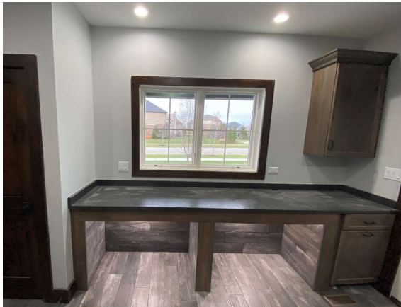
Dog Kennel / Storage