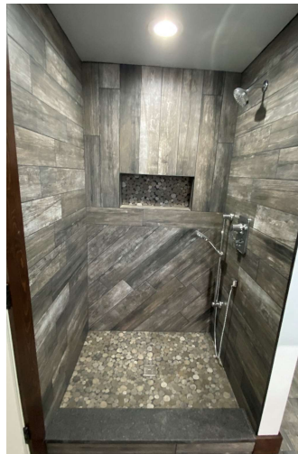
Dog / Pool Shower